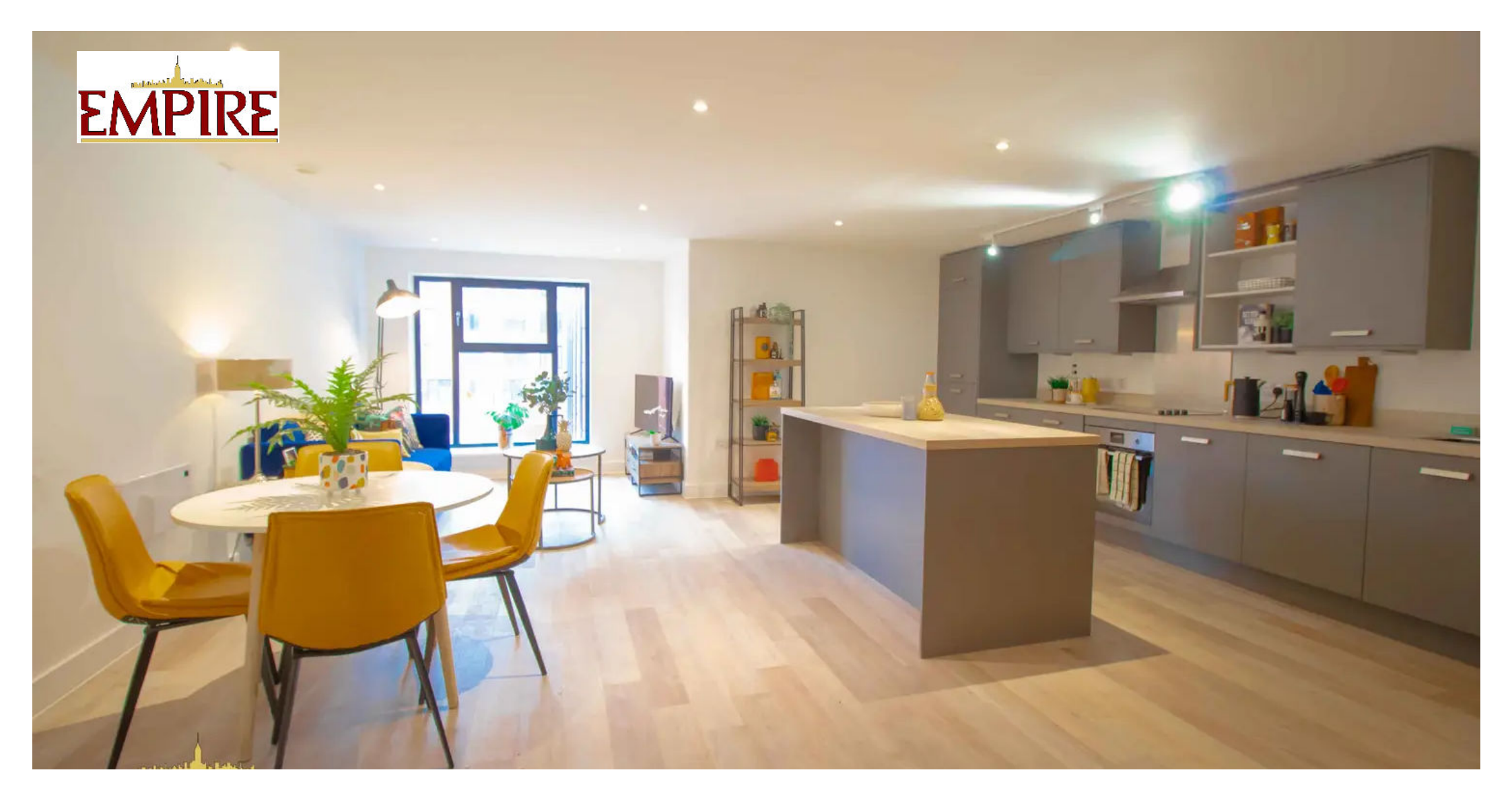
Digbeth One 2, Bradford Street, Birmingham