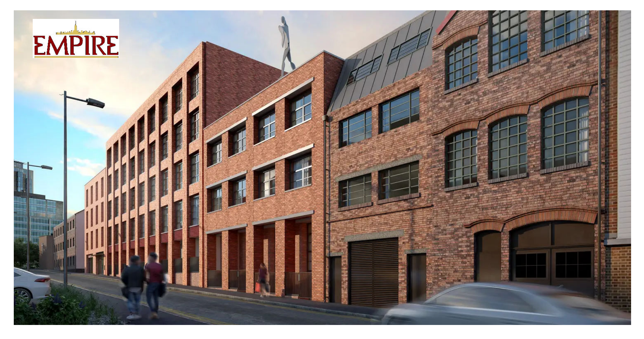
59 Price Street, Birmingham